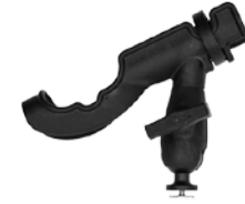
Item # 4013 SPINNING