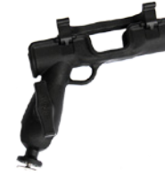
Item # 4023 FLY