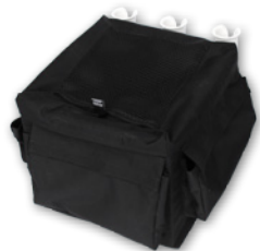
Item # 2430 Fishing Crate Pak