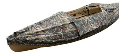
Item # 5012 Layout Duck Blind