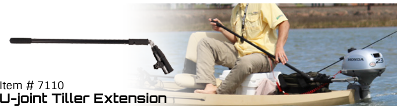
Item # 7110 U-joint Tiller Extension