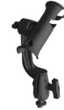
Item # 4043 Zooka Tube