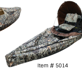
Item # 5014 Upright Duck Blind