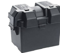
Item # 7130 Battery Box