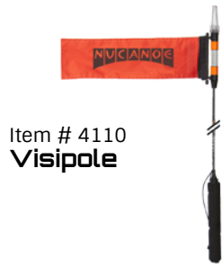
Item # 4110 Visipole