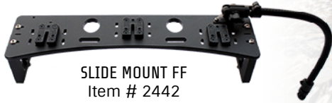
SLIDE MOUNT FF Item # 2442