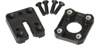
Item # 4006 Mighty Mount + Fullback