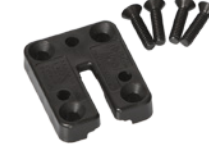
Item # 4005 Mighty Mount